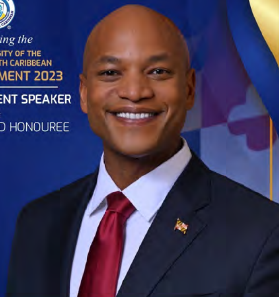
The Honorable Wes Moore Governor of Maryland, USA

COMMENCEMENT SPEAKER & DISTINGUISHED HONOUREE