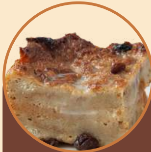
Bread Pudding $500JMD