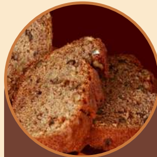
Banana Bread $500JMD