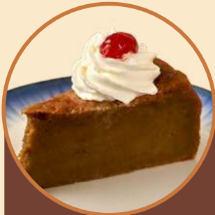
Sweet Potato Pudding